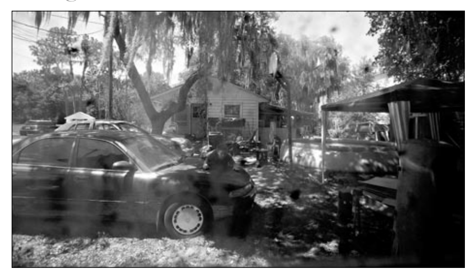
The view through Danielle's window offered a shaft of sunlight and little else: one neighboring house and a junked-up yard. An old blanket covered the dirty, broken window but could not guard against insects; bugs filled the room, and the little girl's body was covered with bites.