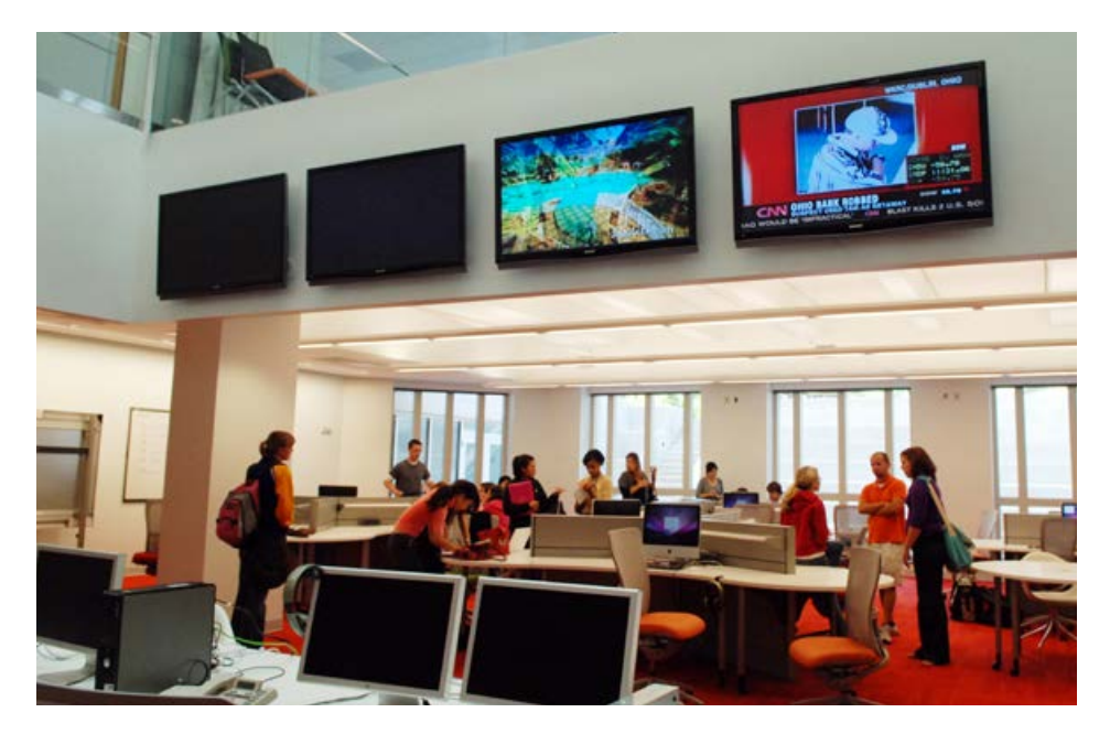
RJI's Futures Lab is a real-world testing venue for new journalism tools and technologies. The lab provides an environment where University of Missouri journalism students, faculty and visitors prototype journalism innovations for delivery to media audiences.

The staff of the Futures Lab also co-teaches a mobile app development class with Mizzou's College of